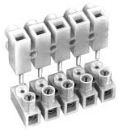
Low Profile Version