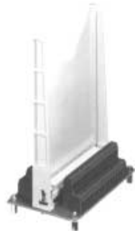
Type MTK (with PCB carrier) for Screw mounting, without module housing (see Order Table, Housing). Dimensions of the mounting holes: 100x62,5 mm.